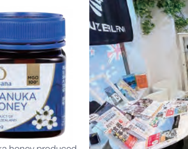
naturally in New Zealand, and contains a strong for sale.

The only New Zealand antenna shop in Japan