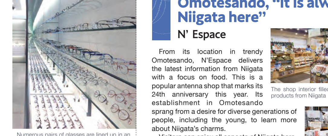
orderly fashion in the store. You may discover your personal favorite amongst them.