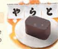
TORAYA Moto-akasaka 2 1-chome

This confectionery shop was founded in Kyoto to produce gifts for the Emperor in the Muromachi Period. It came to Tokyo with the Emperor's move to Tokyo in the Meiji Period. It is a longstanding and famous Japanese confectionery shop. (It is currently being rebuilt and plans to reopen in 2018.)