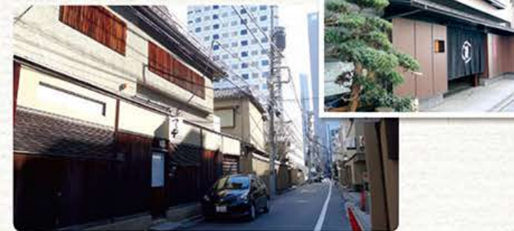
The ryotei which still remains

This is a gentle hill that stretches up from Roppongi, with the ANA Intercontinental Hotel Tokyo on the right. It was given this name because of a large cherry tree at the bottom of the hill prior to the war. Even now the line of trees on both sides of the road forms a wonderful cherry tree tunnel in the spring. It is worth swinging by from Roppongi-dori Avenue and getting refreshed.