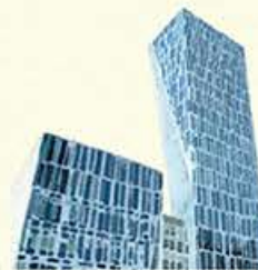
1 Ao Minami Aoyama 5-chome