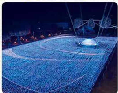
"Midtown Christmas 2016"