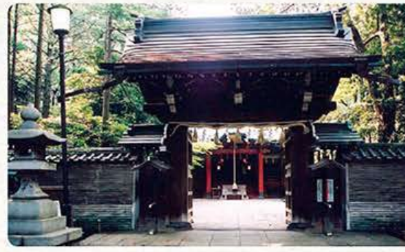
6-10-12 Akasaka, Minato-ku