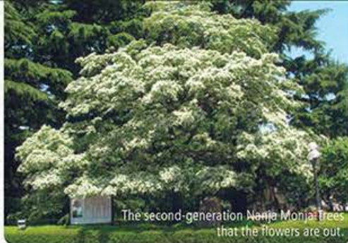
The second-generation Nanja Monja trees that the flowers are out.

New buds on Gaenmae's line of ginkgo trees and Omotesando's keyaki trees signal the arrival of spring in Aoyama. Gentle-blooming cherry blossoms at Aoyama Cemetery and Zenko-ji Temple lift our spirits. Aoyama is a great spot for a stroll in a soft spring breeze.