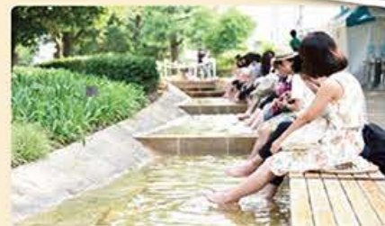
This is the picture that the events were held in 2016

Tokyo Midtown holds various events each year to enjoy summer coolness as part of MIDTOWN ♥ SUMMER. These include ASHIMIZU, where you can rest your feet in a small stream and enjoy the coolness of the water, and SUMMER LIGHT GARDEN, an event with light fireworks in the summer night sky. Why not come and enjoy a cool summer time in Midtown, in the heart of the city?