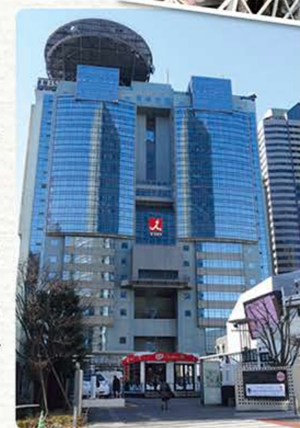
5-3-6 Akasaka, Minato-ku

The arrival of televisions in homes after the war was a historical turning point. TBS moved to Akasaka in 1952 and has evolved along with Akasaka since then. Many entertainers and famous people created a lively environment in this area from past years. Additionally, local volunteers take care of more than 100,000 bees throughout the year on the roof of the TBS low-rise building as "Mitsubacheer - Akasaka BeeTown Project." This project contributes to environmental conservation, environmental learning for children, and activity in the area.