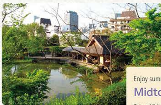
9-7-9 Akasaka, Minato-ku

This is a public park located next to Tokyo Midtown and built at the same time. The Mori family estate was at this site in the Edo Period, and it was given this name because of the numerous hinoki in the area. The park features a small arbor that creates the feeling of Japanese garden, a large pond, a grass area and paths, and unique playground equipment. It is a spot loved by adults and children alike.