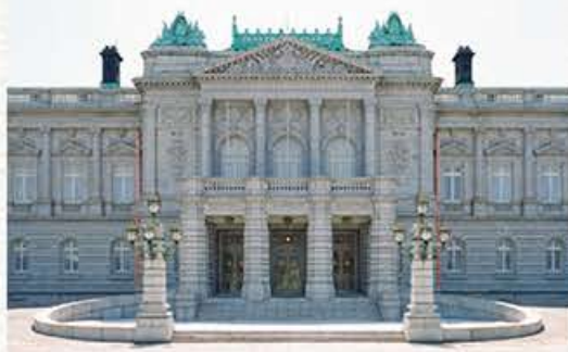
2-1-1 Motoakasaka, Minato-ku

This building was originally constructed as the Togu Palace for Emperor Taisho in 1909 when he was still the crown prince, inspired by the Palace of Versailles and other famous sites. The walls, ceilings, and carpets in each room contain works from painters and craftsmen who represent Japan. It was utilized as the National Diet Library after the war. It was converted to a state guest house (Geihinkan) for state visitors and others in 1974 and was designated as a national treasure in 2009.