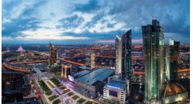
Day and night in the modern city of Astana