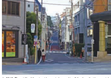
the area has lost a lot of its trees. So much has changed that it is hard to imagine the Kogaibashi Bridge, with the

In 2013: The width of the street has not changed in all the time that has past, bu