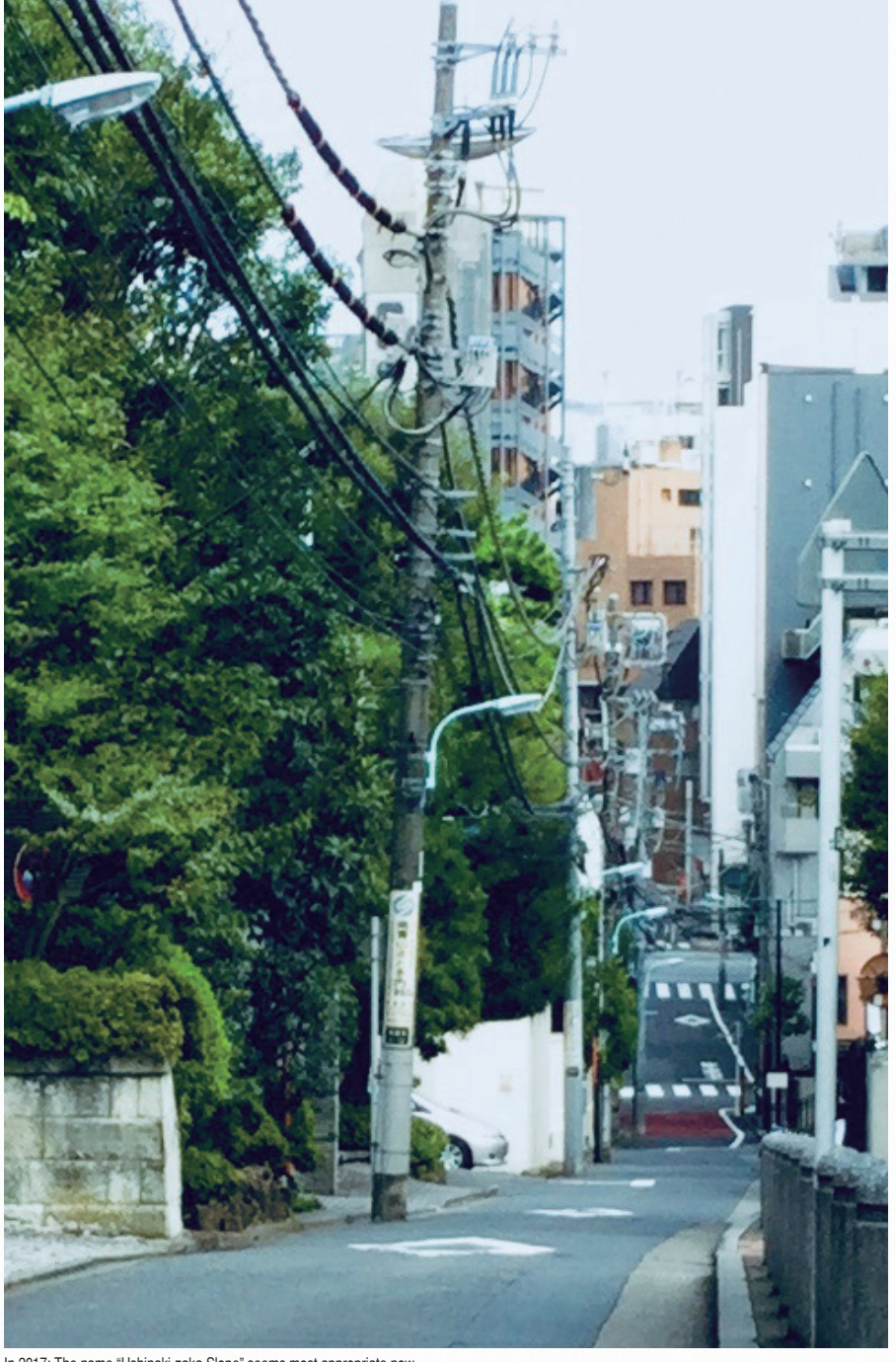
In 2017: The name "Ushinaki-zaka Slope" seems most appropriate now. Viewed from this very different point, we get the impression that the angle of the slope is steep indeed

Following this harrowing experience, he was able to reach Kyoto, his home, where unfortunately further hardship awaited him