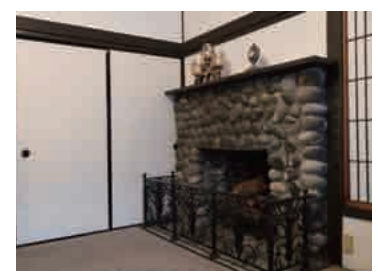
Rare scene of the Japanese room with sliding doors and shoil no longer a functioning fireplace, but still makes a magnificent