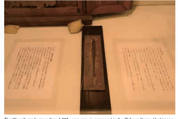
The "Kogai", made more than 1,000 years ago, is preserved in the Shibuya Konno Hachimangu shrine. It's astonishing that it remains with us, and in such great condition

It is amazing that this artifact, clear evidence of the "Kogai" legend, was not lost in time. So much has changed since this story occurred, but an important piece of it has been preserved after more than 1.000 years