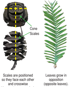
and crosswise (decussate cone scales)

Let's shift our focus to the leaves and cones. The leaves of the Metasequoia grow oppositely, and their cone scales also grow in cross opposite (decussate). On the other hand, Redwood and deciduous Bald Cypress (also called "Rakuusho" in Japanese) leaves grow alternately, and they have obliquely lined cone scales. When cone scales like this mature, they come apart.