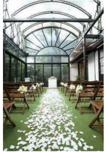
An open wedding ceremony space surrounded by green plants with the open skies above has been incorporated This space is not visible from the front of the building.