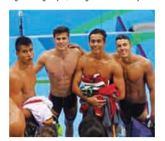
Spanish National Team relay members completed the relay of 4 x 100m at the Rio Olympic Games