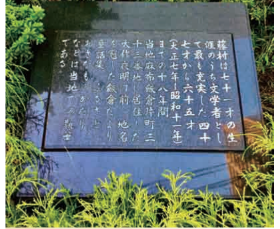
Present View of the Site of Toson Shimazaki's Former Mansion, August 2017