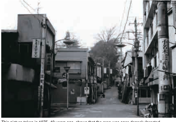
This picture taken in 1975, 42 years ago, shows that the area was once densely forested

The town that once proudly bore the name "Kogai" no longer exists, but there are some places here and there where the name "Kogai" still comes up. In this way, the legend persists, and offers us a lesson in history