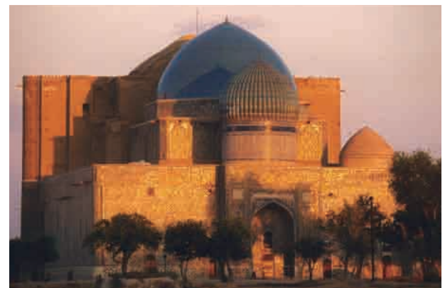
Mausoleum of Khoja Ahmad Yasawi on the Silk Road, a World Heritage Site