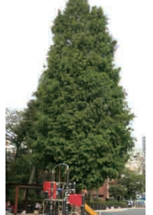
The Roppongi West Park's Symbolic Tree

Azabu is a place where large trees grow in narrow spaces, and because of that, heavy construction machinery cannot be used for maintaining these trees. It makes our job rather difficult and challenging. not only given the conditions on the ground, but also because residents have different values and opinions regarding how the trees should be managed. However, after making drastic decisions, if we hear positive feedback saying "good job – it is far better than before", we certainly feel relieved and happy.