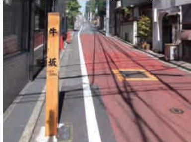
In 2013, viewed from the bottom, the slope looks very gentle So perhaps this slope didn't make oxen bellow for mercy.

The view from the hilltop is more marvelous than you might think.