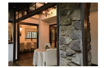
me earthquake reinforcement has been carried out for the building, and the stones forming the pillar are the same as