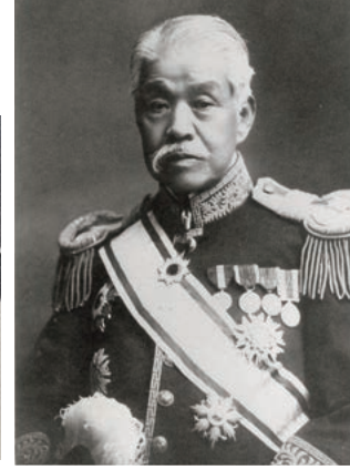
Saburo Ozaki in 1907