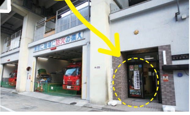
The likura Fire Station Branch under the elevated Metropolitan Expressway

This event is organized and run by the Higashi-azabu Shotenkai (Merchants'Association). It was started to encourage live-in workers who came to Tokyo from the Tohoku area. This community-based Festival is held in the fall every year on