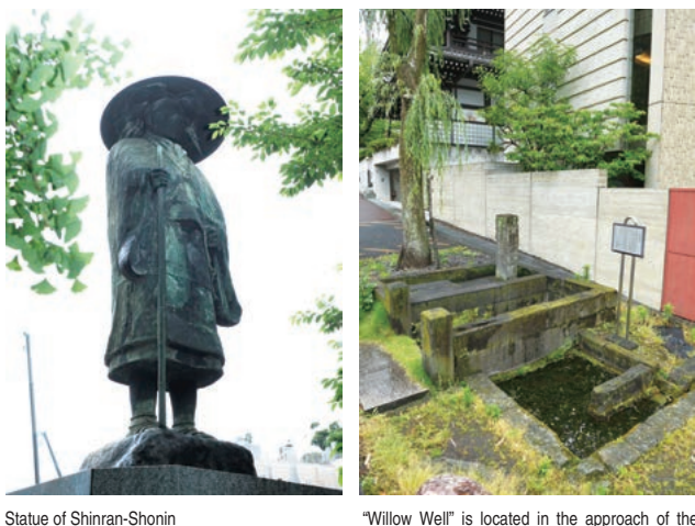
"Willow Well" is located in the approach of the temple. Water still comes up from the spring

I myself graduated from Azabuyama Kindergarten and still live close by. However, it had been a long time since I had visited Zenpuku-ji Temple. While listening to the chief priest of the Temple and the principal of the kindergarten, long forgotten memories suddenly came back. When I was a kindergarten student, I always used to carry a yellow bag over my shoulder. I have vague memories of how the main hall and the Upside-Down Looking Gingko Tree looked back then. Several decades have passed since that time, and the scenery has changed but the Temple trees I looked up to when I was a kindergarten student are still gently swaying in the breeze, watching over the town just like before.