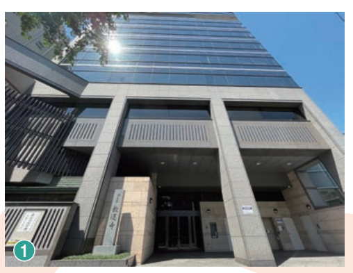
Kyouun-ji Temple is now in a large concrete building.