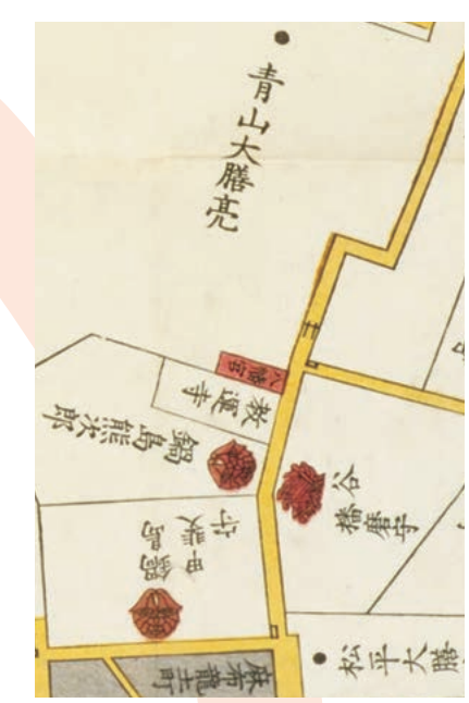
"Aoyama Shibuya Map" <mark>made in 1853</mark>

The land on the Azabu side between Tokyo Midtown and Aoyama Cemetery was a large area used by the military, and the 3rd infantry regiment was based there. Nowadays, the National Art Center Tokyo and the National Graduate Institute for Policy Studies are in this area. Moreover, the Public Dormitory for members of the House of Representatives 2, the Science Council of Japan building 3, Metropolitan Aoyama Park 4 and a US Military Facility 5 are located along the border.