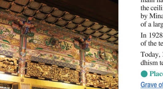
(transom) Engravings in the main hall sanctuary