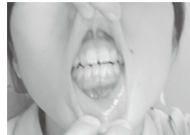
Pull lips to the various directions and try to look.