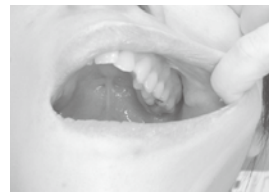
Open cheeks and try to look at the back of the tooth cervix alignment of teeth.