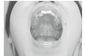
Open a mouth and try to look at the depths of the throat and the back of the tooth.