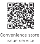
Convenience store issue service

Regarding the My Number Card : Shiba Regional City Office, Residents Support Section, My Number Card Issuance Promotion Subsection TEL 03-3578-3139