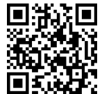
Electronic application form (Application for Use of Pupils' Club)