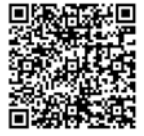
Minato City Website (Information about Pupils' Club enrollment) (in Japanese)