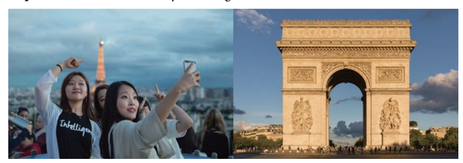
Experience an animated journey to France

Inquiries: Global Community Planning Subsection, Tel: 03-3578-2046