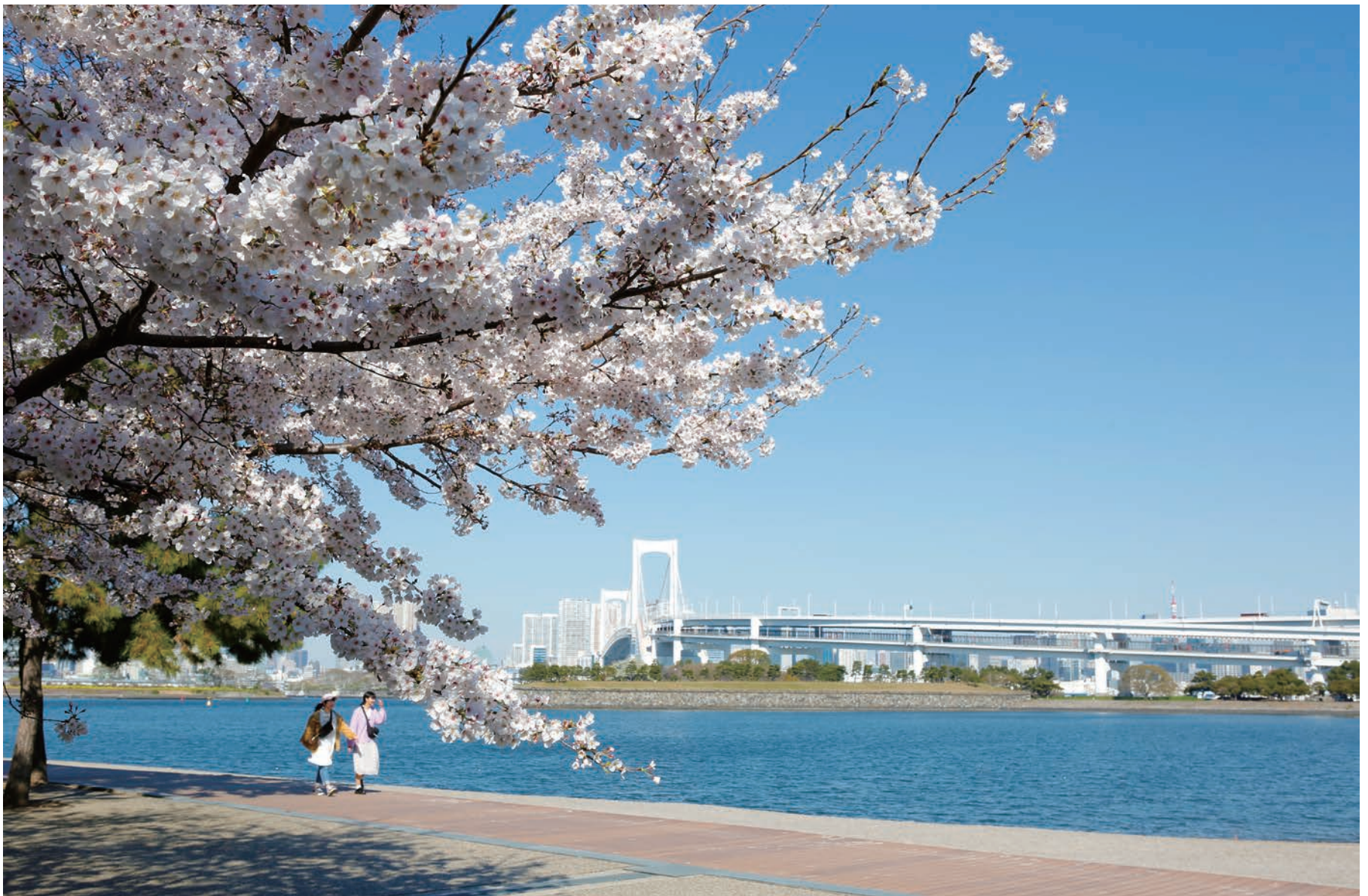
Cherry blossom flowers bloom in Odaiba Kaihin Park