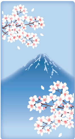
Shippo Yaki with the design of cherry blossom and Mt. Fuji

Shippo Yaki or cloisonne enamelware is a craftwork made by placing glassy glaze on a metal. In Japanese, Shippo means seven treasures and it is derived from the Buddhist sutra, expressing the beauty of seven treasures being spread out. With its radiant colors depicting Japanese nature and scenery, it is highly acclaimed both in Japan and abroad. It has been designated as traditional craft representing Japan by the Ministry of Economy, Trade, and Industry. Abroad, it was introduced at the Paris International Exposition in 1867.