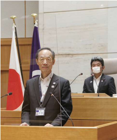
*As a measure for COVID-19 infection, an acrylic panel has been placed on the podium at the venue of the City Assembly to prevent the spread of spittle.

Mayor Takei delivered the city policy speech regarding the future administration at the 2020 regular meeting of the City Assembly. For more information, please visit Minato City Web.