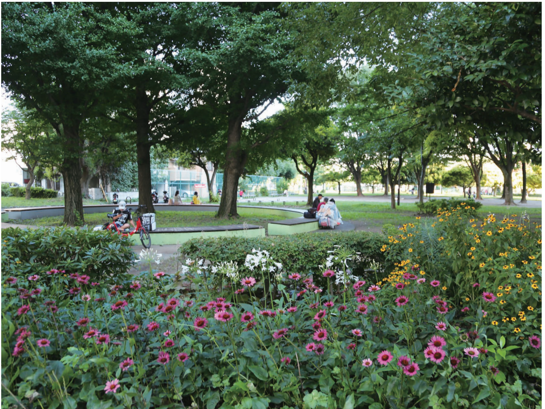
Aoyama Park, Minami-aoyama 2-21-12