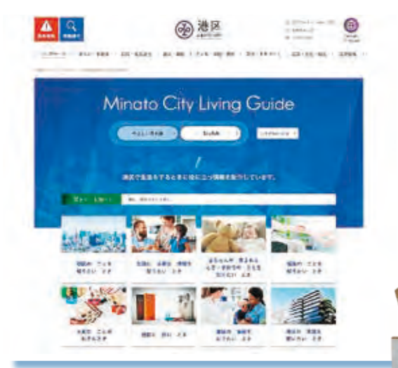
Sample PC screen

Easy Japanese uses less complicated expressions than Japanese use on a daily basis, making it easier for foreign residents to understand.