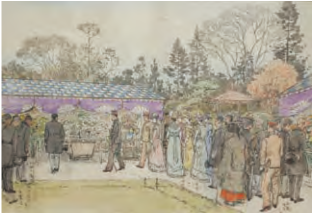
Kangikukai at the Akasaka Detached Palace From the Meiji-tenno Gyoki fuzu-kohon 2, Imperial Household Archives

Inquiries: Minato City Local History Museum, Tel: 03-6450-2107