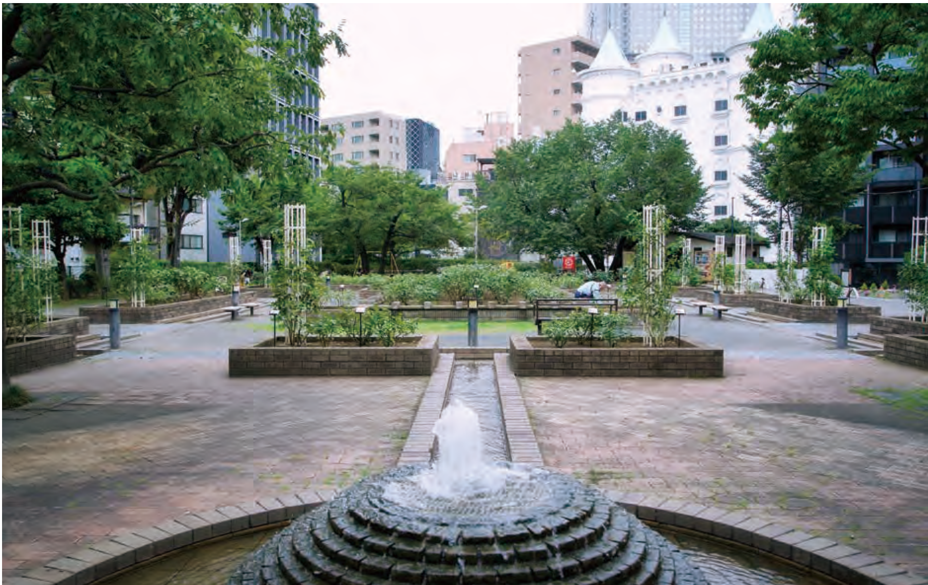
Hikawa Park, 6-5-4 Akasaka