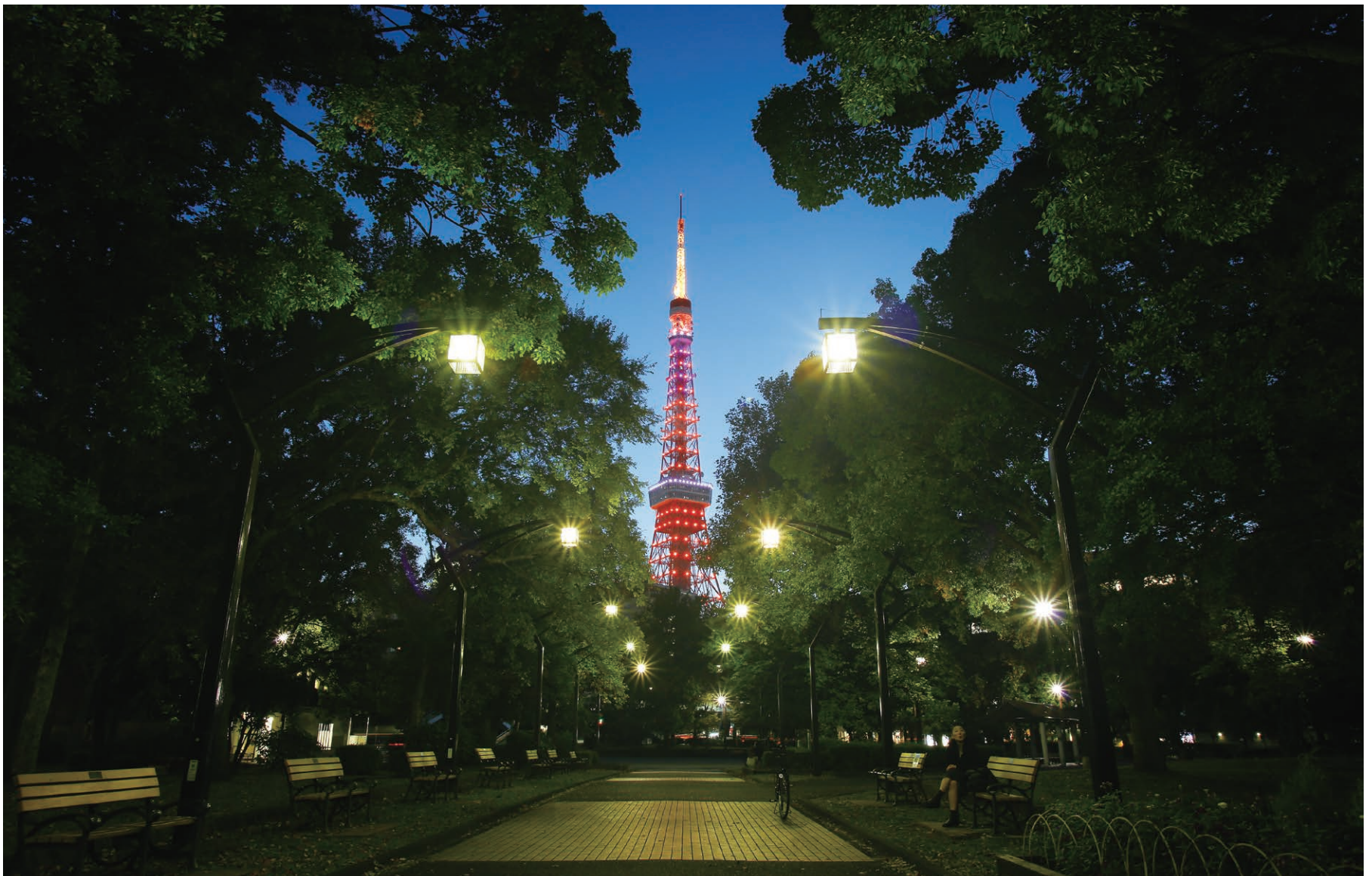
Shibakoen and Tokyo Tower