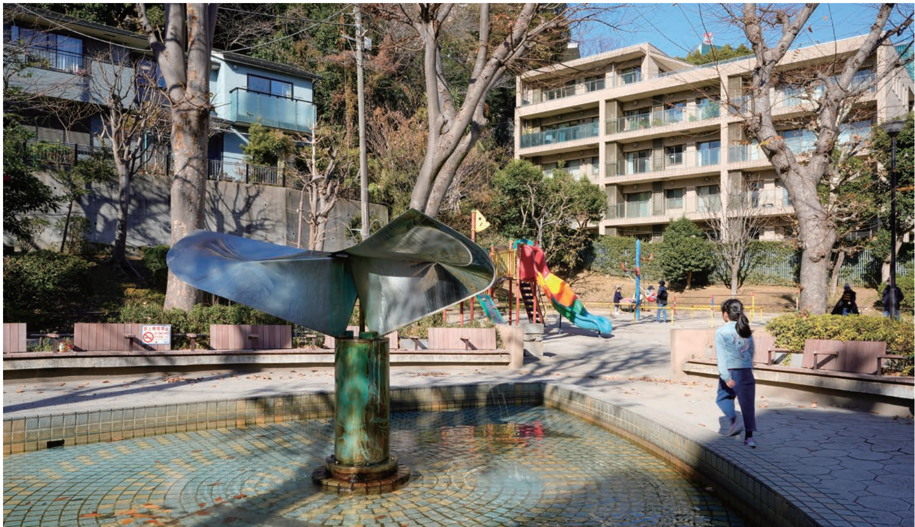
Mamiana Park, 63 Azabu-mamianacho

Final Income Tax Return is a procedure in which taxpayers report their total income earned from January 1 to December 31, and pay or adjust their tax amount accordingly. By adjusting the excess or deficiency of their tax amount already deducted from their employment income or other income sources, individuals will pay tax or receive a tax refund according to their final income. This procedure is called kakutei shinkoku , final income tax return. Both of the due dates for filing the Final Income Tax Return and the payment of income tax is March 15.