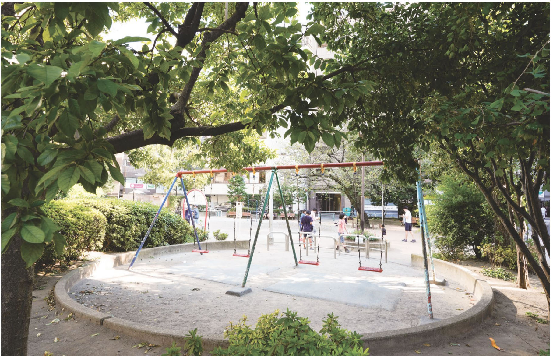
Amishiro Park, 2-15-1 Azabu-juban