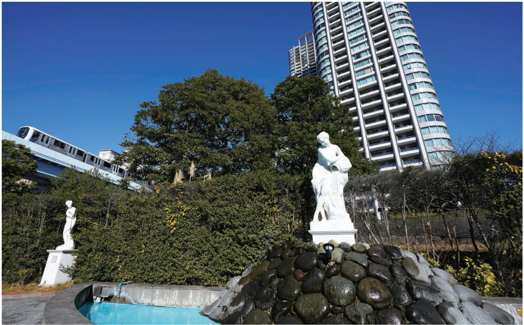
Italy Park, 1-10-20 Higashi-shimbashi