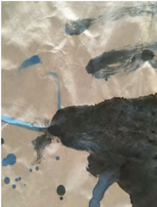
Blue Ocean Wave