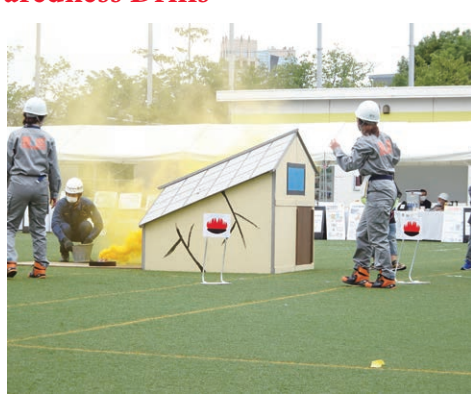
CONTINUED TO NEXT PAGE>>

To protect our own lives and community by ourselves in case of a major earthquake, Minato City, the police department, and the fire department will cooperate together to conduct comprehensive disaster preparedness drills. Let's call on each other, and actively participate in comprehensive disaster preparedness drills.