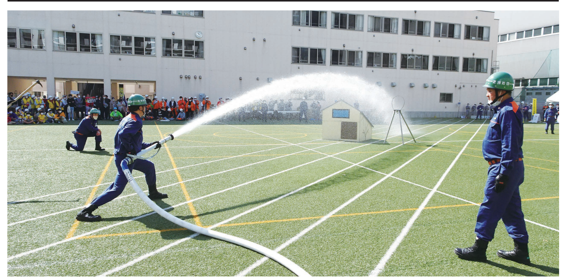
Disaster Preparedness Drill in 2022