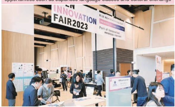
Create effective industry that fosters a local community of industry-academia-government collaboration