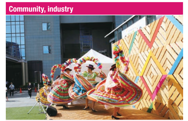
Promote community participation of foreign residents through opportunities such as Japanese language classes and cultural exchange