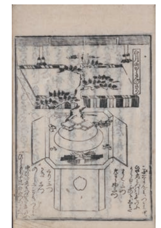
A Practical Guide to Women's Etiquette, 1688