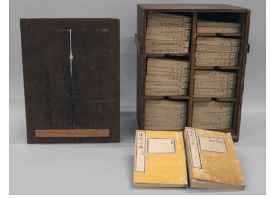
Kanji Dictionary in a Box

¥200 for adults, ¥100 for high school students and under Inquiries: Minato City Local History Museum, Tel: 03-6450-2107