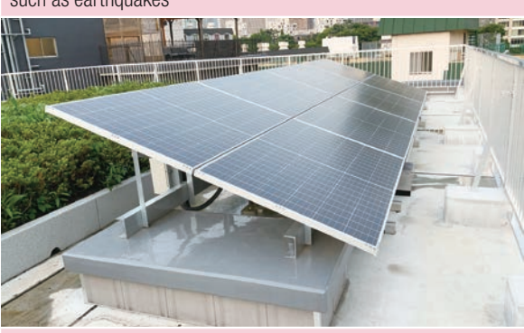
Advance decarbonization towards becoming a Zero Carbon City by 2050