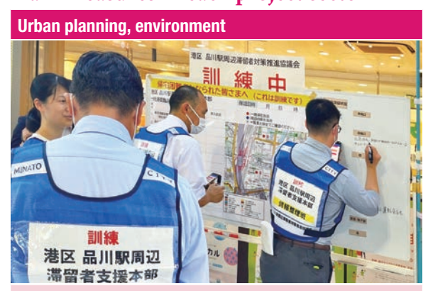
Improve disaster response measures against natural disasters