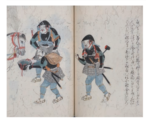
Collection of Experiences from the Sengoku Era, 1570–1602

The Edo era was a time when reading books became available among the common people. Various books circulated, giving clues of human activities at that time.