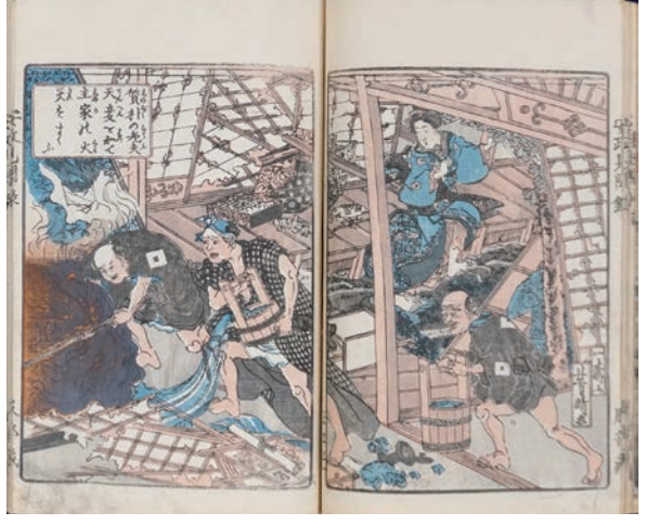
Records of Disasters in 1856

4/27 to 6/30, 9 a.m. to 5 p.m., until 8 p.m. on Saturday