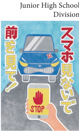
Junior High School Division