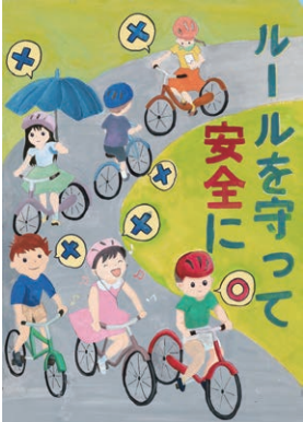
Elementary School Division