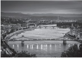
A spectacular view of the Danube River upstream in Budapest, the capital of Hungary