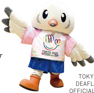
TOKYO 2025 DEAFLYMPICS OFFICIAL MASCOT, Yuriito