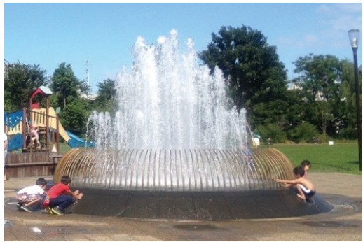
Konan Ryokusui Park