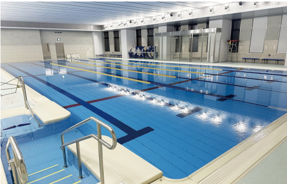
Akasaka Gakuen Akasaka Junior High School