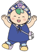
"Satomin" the Minato City foster parent system promotion character

Child Consultation Section, Administrative Coordination Subsection TEL 03-5962-6500