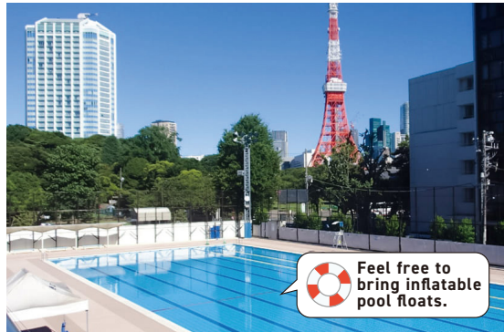
Shiba Park Multi Purpose Sports Field(Aqua Field Shiba Park)

Shiba Park Multi Purpose Sports Field (Aqua Field Shiba Park)