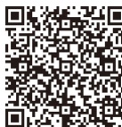
Multilingual Interpreter Call Service

A person who needs translating service, the operator who will interpret and Minato city staff can talk in group of three. Our system allows people to choose their preferred language in advance on their smartphone, and have an entire conversation on the phone with the staff in the various departments of City Hall, through an interpreter. This service is available in 13 languages.