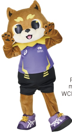
Riku One mascot of WCH TOKYO 25