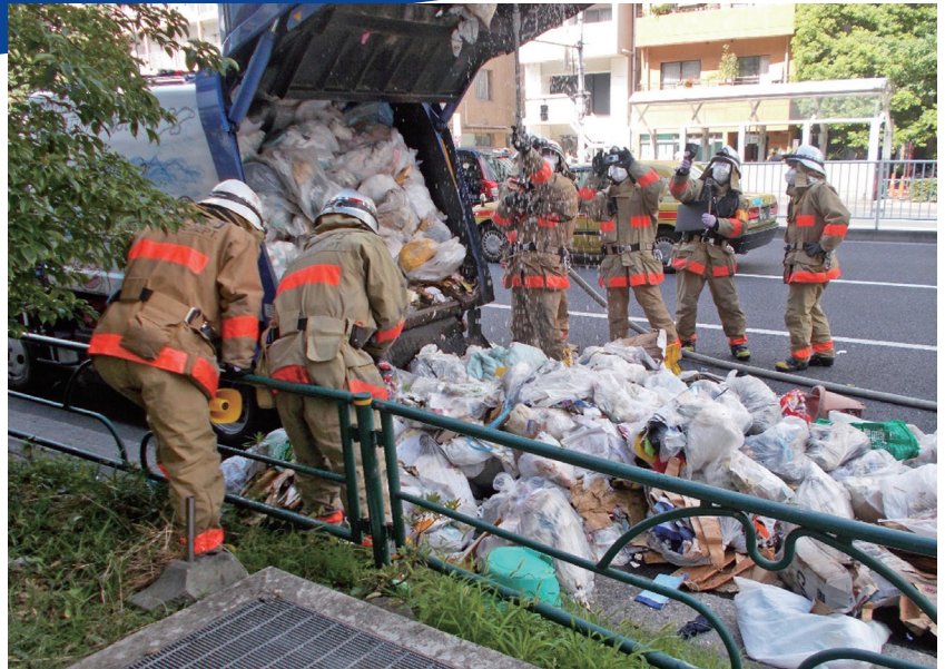
The scene of a fire in a garbage collection truck within the city.