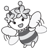
Beekeeping Project Character Shibacchi

Project Overview The Shiba Regional City Office operates a beekeeping program with the aim of promoting exchanges among local residents by raising honeybees and making use of the harvested honey. Product for Sale Minato City Shiba-area honey Shibamitsu® 50 g: 500 yen (tax included) *Up to two jars per person *Planned quantity: 570 jars Lottery Results We will notify you by email or postal mail around late February. Pick-up for Winners 3/11(Wed.) at the Minato City Office, First Floor Lobby *We cannot ship the product by mail. Application Apply by phone from Thursday, February 5 to Sunday, February 8, by calling Minato Call (Hours: 9:00 a.m. to 5:00 p.m.; on the first day, from 2:00 p.m.). TEL 03-5472-3710 You can also apply via the online application form.