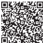
Multilingual Interpreter Call Service

A person who needs translating service, the operator who will interpret and Minato city staff can talk in group of three. Our system allows people to choose their preferred language in advance on their smartphone, and have an entire conversation on the phone with the staff in the various departments of City Hall, through an interpreter. This service is available in 13 languages.