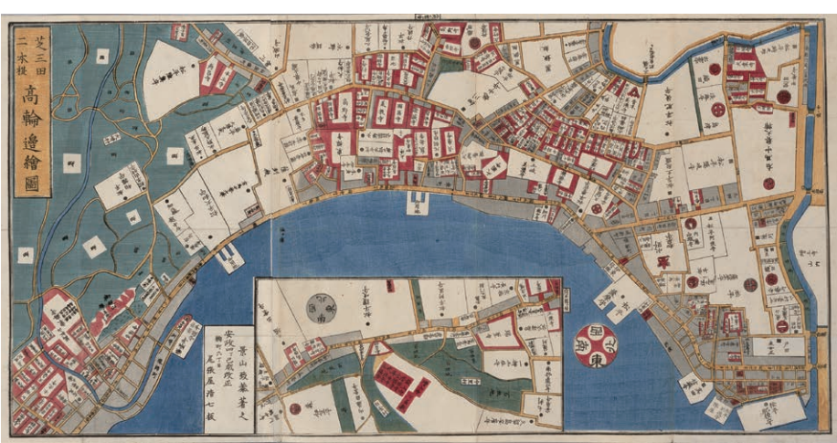
Kirie-zu - Illustration of the Shiba, Mita, Nihonenoki, and Takanawa Areas 1857