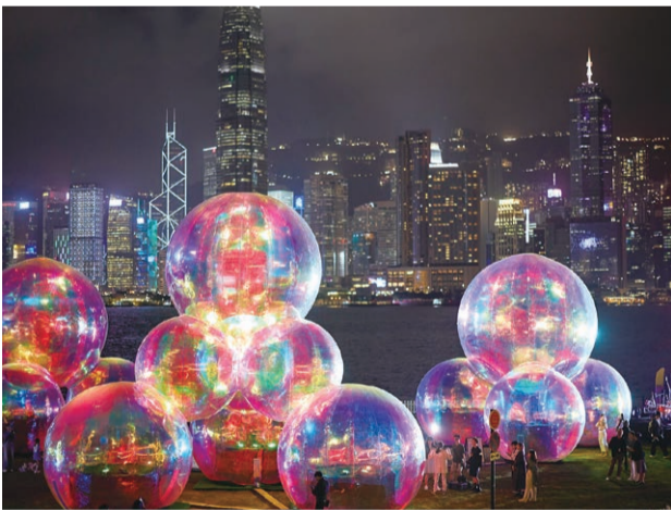
Atelier Sisu EPHEMERAL COLLECTION