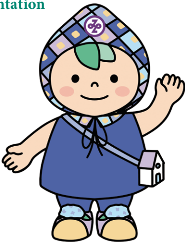
Minato City Character Satomin to Raise Awareness on the Foster Parent System

Application: Call below dial, 8:30 a.m. - 6 p.m. by 10/24 for reservation.