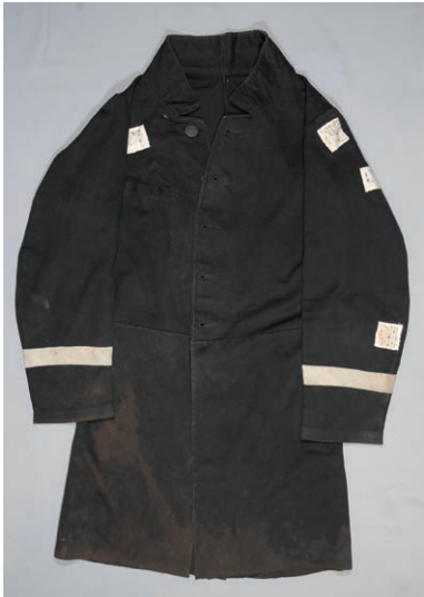
Uniform of government army soldiers