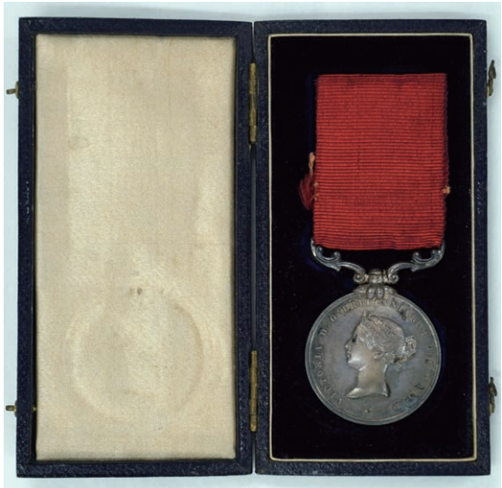
A silver medal gifted by the British government

We will reflect on the history of the Bakumatsu and Meiji Restoration through events related to Minato City that significantly impacted Japanese history. Date & time: 10/19 to 12/15, 9 a.m. to 5 p.m., until 8 p.m. on Saturday Place: Special Exhibition Room, Minato City Local History Museum, 4-6-2 Shirokanedai Closed: 11/21 Fee: ¥400 for adults, ¥200 for high school students and under Free admission for residents aged over 65 and disabled residents, elementary to high school students residing and studying in Minato City. 11/3 is admission-free for residents. Please bring your ID to verify your address. Inquiries: Minato City Local History Museum, Tel: 03-6450-2107