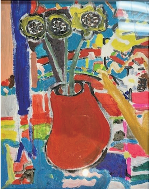
“Sunflower” from Tairaka