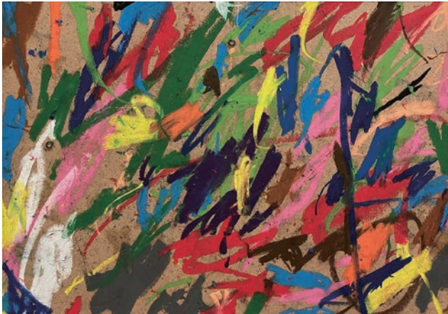
“Composition” from The Temporary Day Support Service