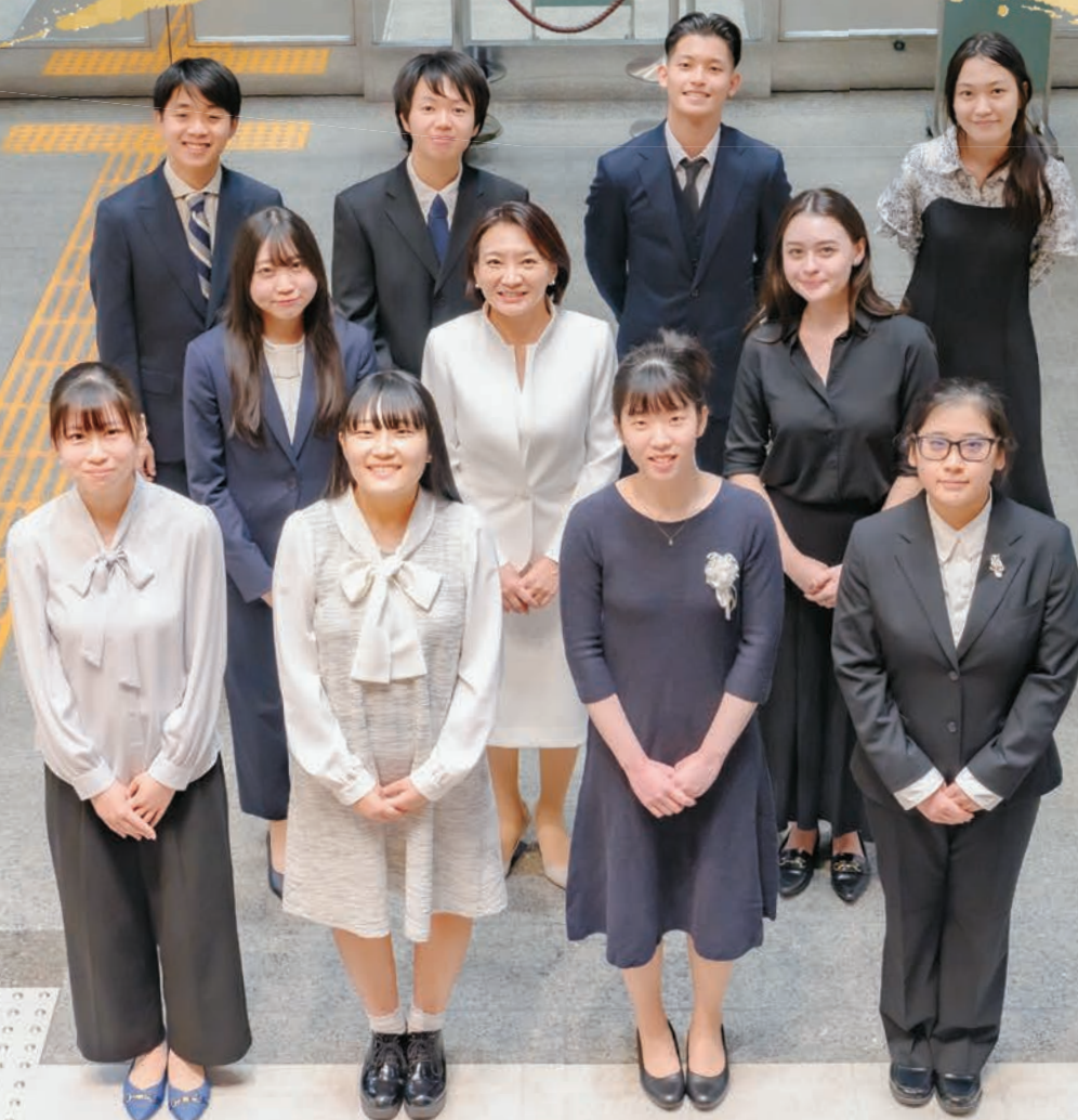
The Mayor and the members of the “Hatachi no Tsudoi” Executive Committee