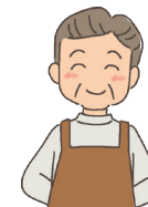
People at your regular shops