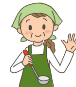
People at Kodomo Shokudo (Children's cafeterias)