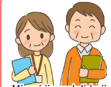
Minsei-iin and Jido-iin (Welfare Commissioners and Child Welfare Commissioners)