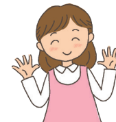
People at children's halls