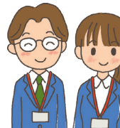
People at Minato City Hall and Regional City Offices