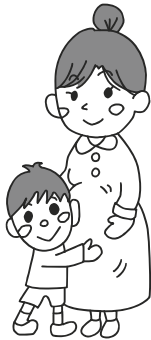
Take care with your oral health during pregnancy