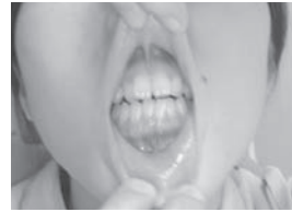
Pull lips to the various directions and try to look.