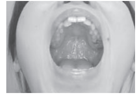
Open a mouth and try to look at the depths of the throat and the back of the tooth.