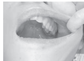
Open cheeks and try to look at the back of the tooth cervix alignment of teeth.