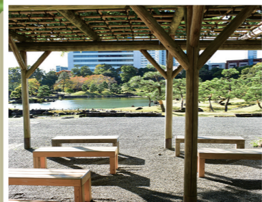
After strolling through the garden, relax on a bench to take in the scenery.