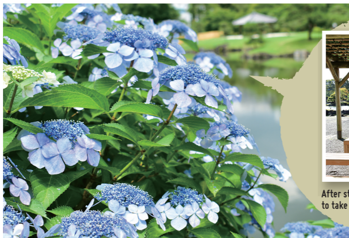
Enjoy flowers that bloom according to the season.

POINT! There is a garden map outlining the suggested route for wheelchair users.