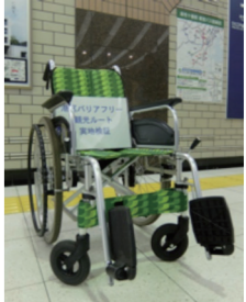
Example of a wheelchair used for field verification

This map introduces 15 standard courses connecting popular tourist spots in Minato City. We conducted field tests using a wheelchair when we created this map. In addition to sightseeing and barrier-free information for each facility, we provide actual photographs of barrier-free information on travel routes and points of travel, and display them in an easy-to-understand manner. Please note that the time required for each course and travel time will vary depending on the physical condition, health, and the standard of the wheelchair (such as whether it is manual or electric) of the person going on the tour, so please use this information as a guide only. Additionally, each course may require a caregiver as there are some places where it is difficult for the wheelchair user to move or brake on their own (this map was created based on the assumption that a caregiver will accompany the wheelchair user). The map suggests just one example of a route for the course, so please feel free to change the course according to your mood or the season.