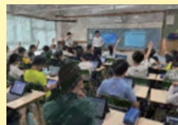
Special classes in municipal elementary schools