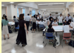
Exchanging opinions at the council meeting