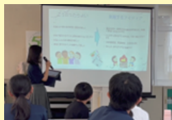
Presentation at the council meeting