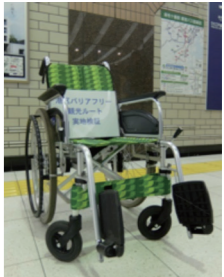
Example of a wheelchair used for field verification

This map introduces classic 15 courses connecting popular tourist sites of the Minato City. In creating this map, we used an actual wheelchair to verify the information on the respective sites. In addition to tourist information and barrier-free information for each facility, this map also offers visual images, barriers on the travel routes, barrier-free information, and tips in an easy-to-understand format. The required time and traveling time of the indicated courses will vary depending on conditions such as the state and physical condition of the person going out, whether the wheelchair is manual or electric, etc. Therefore, please use it only as a reference. In addition, each course may require a helper due to the difficulty of wheelchair control either by a helper or the wheelchair user. (This map was created based on the assumption of an accompanying helper.) The suggested courses are only examples of our recommendations. Do feel free to plan your routes flexibly according to your mood and the seasons.