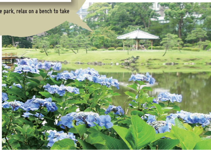
Enjoy flowers that bloom according to the season.

POINT! There is a garden map outlining the suggested route for wheelchair users.