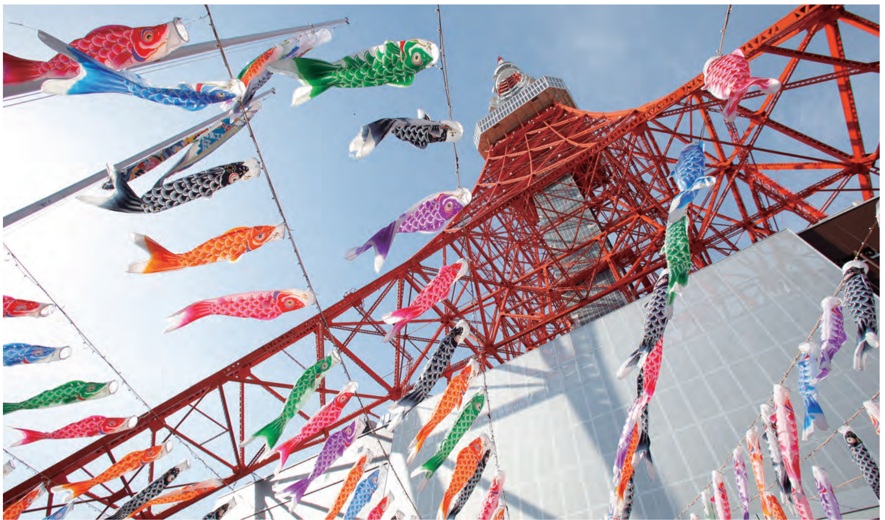
Koinobori "swimming" up Tokyo Tower, 4-2-8 Shibakoen