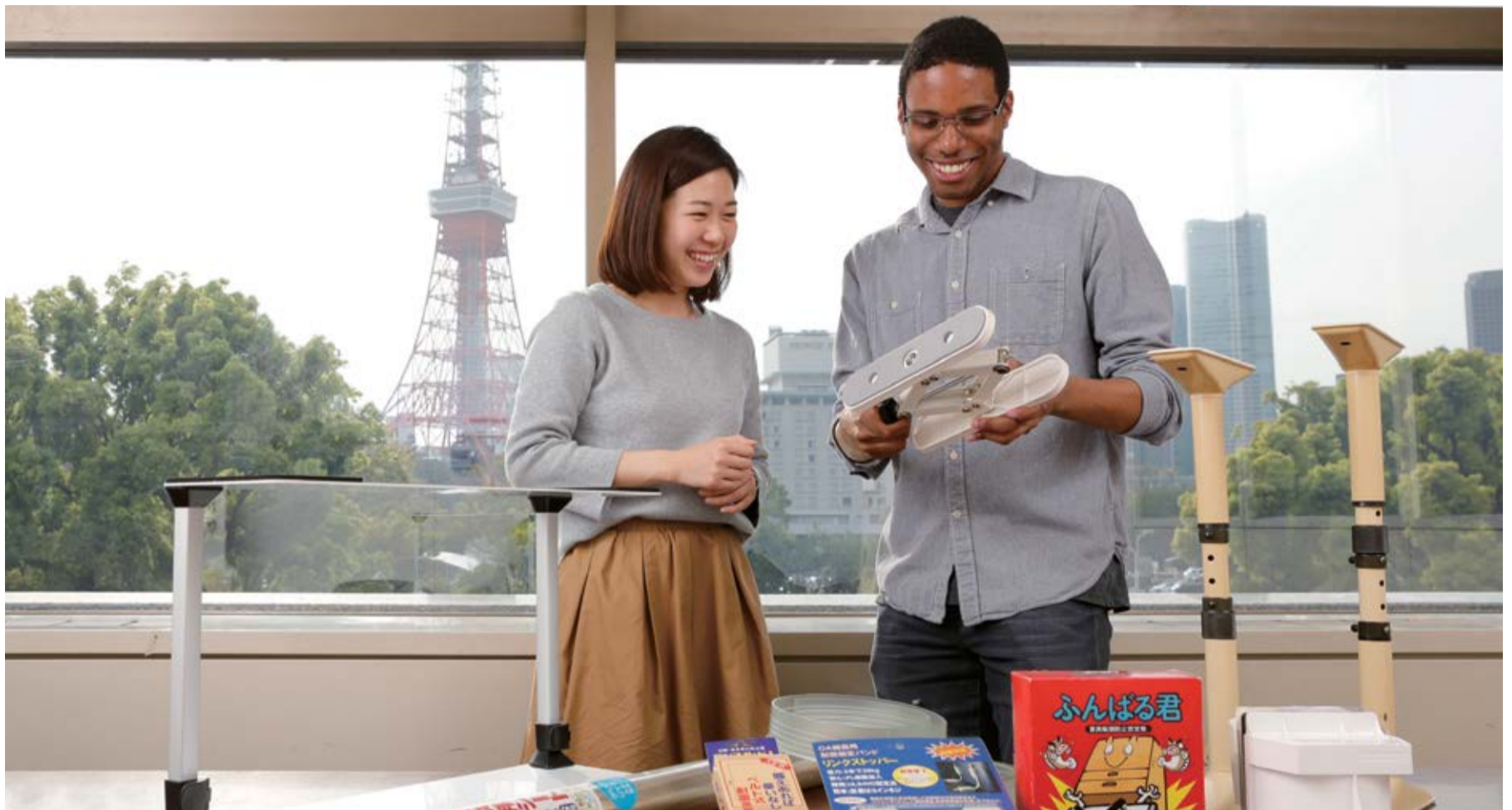
Installing furniture tipping prevention aid