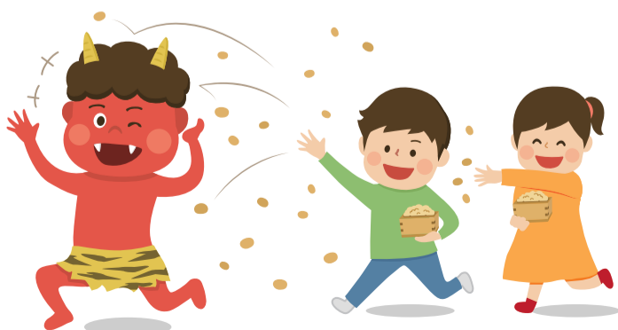
Children throwing soybeans at a demon.

This custom implies that the demons would arrive at the change of the seasons. And people throw soybeans to drive out evil and bring good fortune. After throwing soybeans, people would eat the same number of beans as their age and pray for good health.