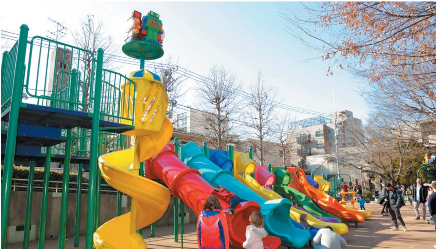
Have fun with robots and colorful slides at Sakurazaka Park, 6-16-46 Roppongi.