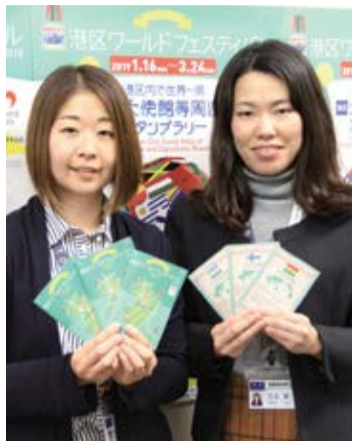
Minato City staff holding the Minato City World Festival passports on the left and cards on the right.

Inquiries: Minato City World Festival Administration Office Call Center, Tel: 03-6737-9397, 10 a.m. to 5 p.m.