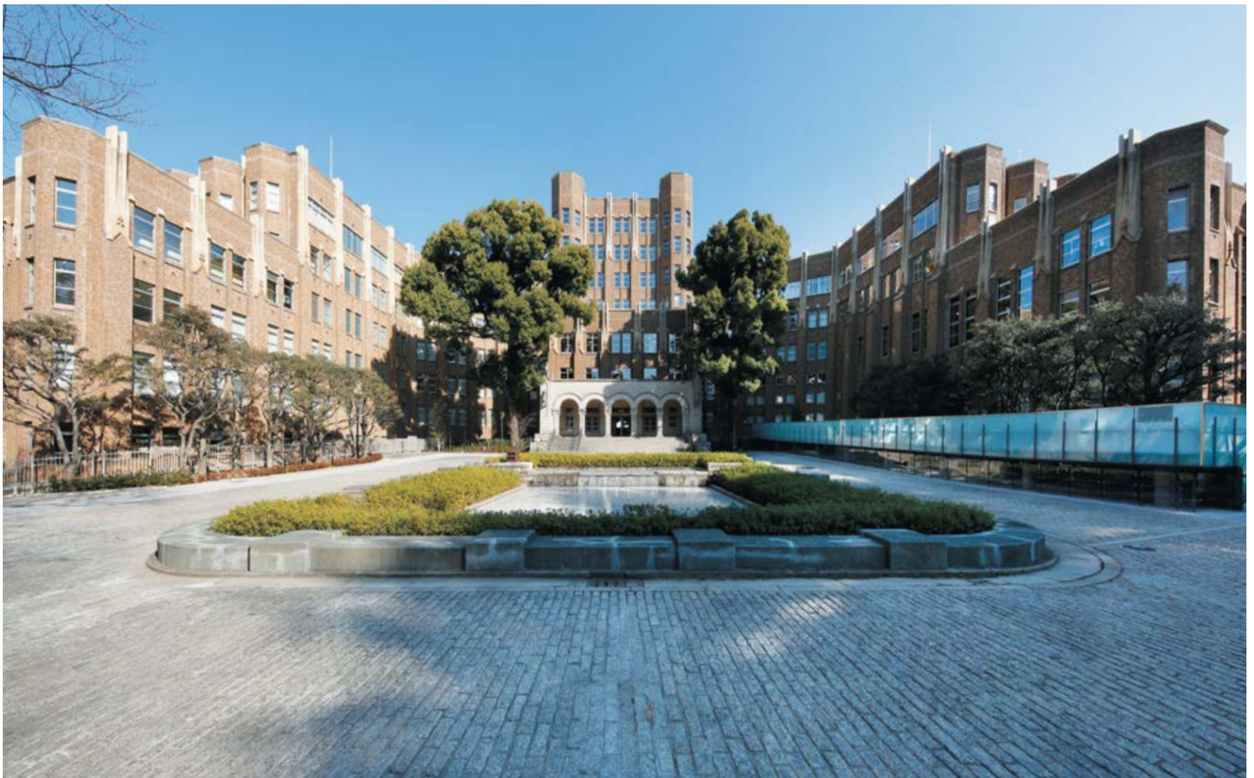
Front entrance of Minato City Local History Museum in the Yukashi-no-mori compound facility