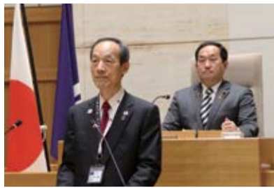
Mayor of Minato City on the left and Chairperson of the Minato City Assembly on the right.

At the first 2019 regular meeting of the Minato City Assembly that opened on February 13, Mayor Masaaki Takei delivered a policy speech regarding the city administration. For more details about the policies and fiscal 2019 budget, please see the Minato City Web.