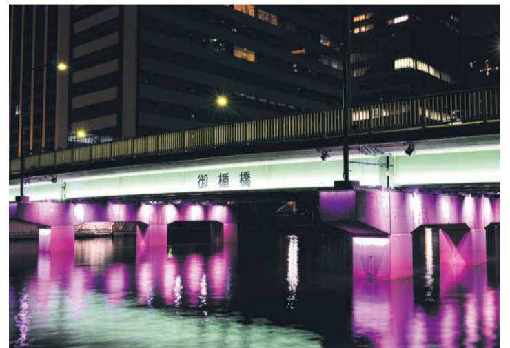
Lighting up of Mitate Bridge

Supervising Subsection: Community Development Subsection of Shibaura-konan Regional City Office