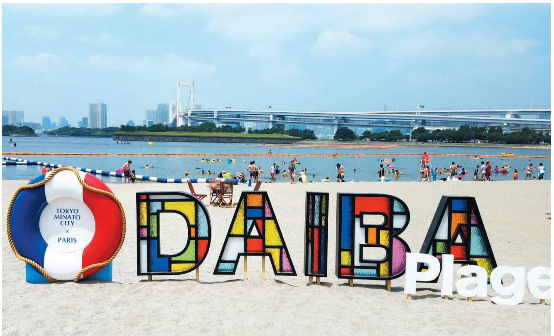
Enjoy your summer at Odaiba beach.