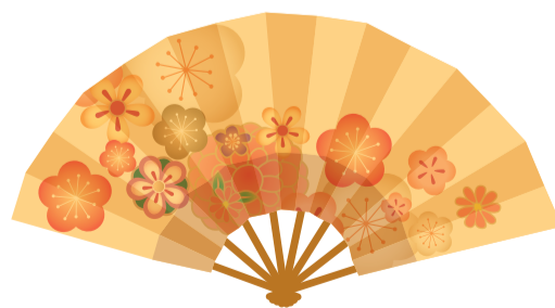
Sensu , folding fan depicting Japanese scenery and nature.

If you look closely, you may be astonished by its elegance and perfection, created by craftsmen's refined techniques that have been handed over for more than a hundred years until today.