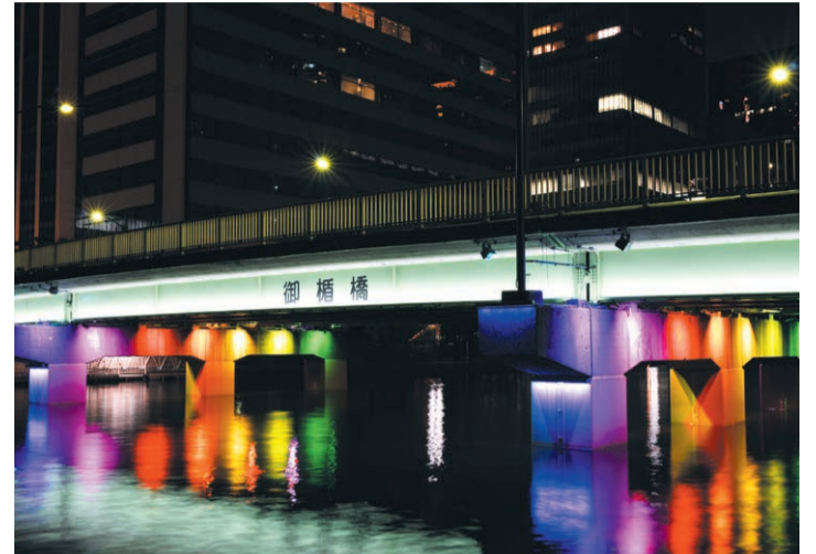
Lighting up of Mitate Bridge

To enhance the beauty of the waterfront area, and to boost the tourism industry and the local community, Minato City is lighting up the bridges and monuments in the Shibaura-konan area.