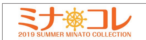
Official logo of MINATO COLLECTION

Please send your own essay or drawing to express your excitement or discovery seeing the arts. You may have a chance to win a prize.