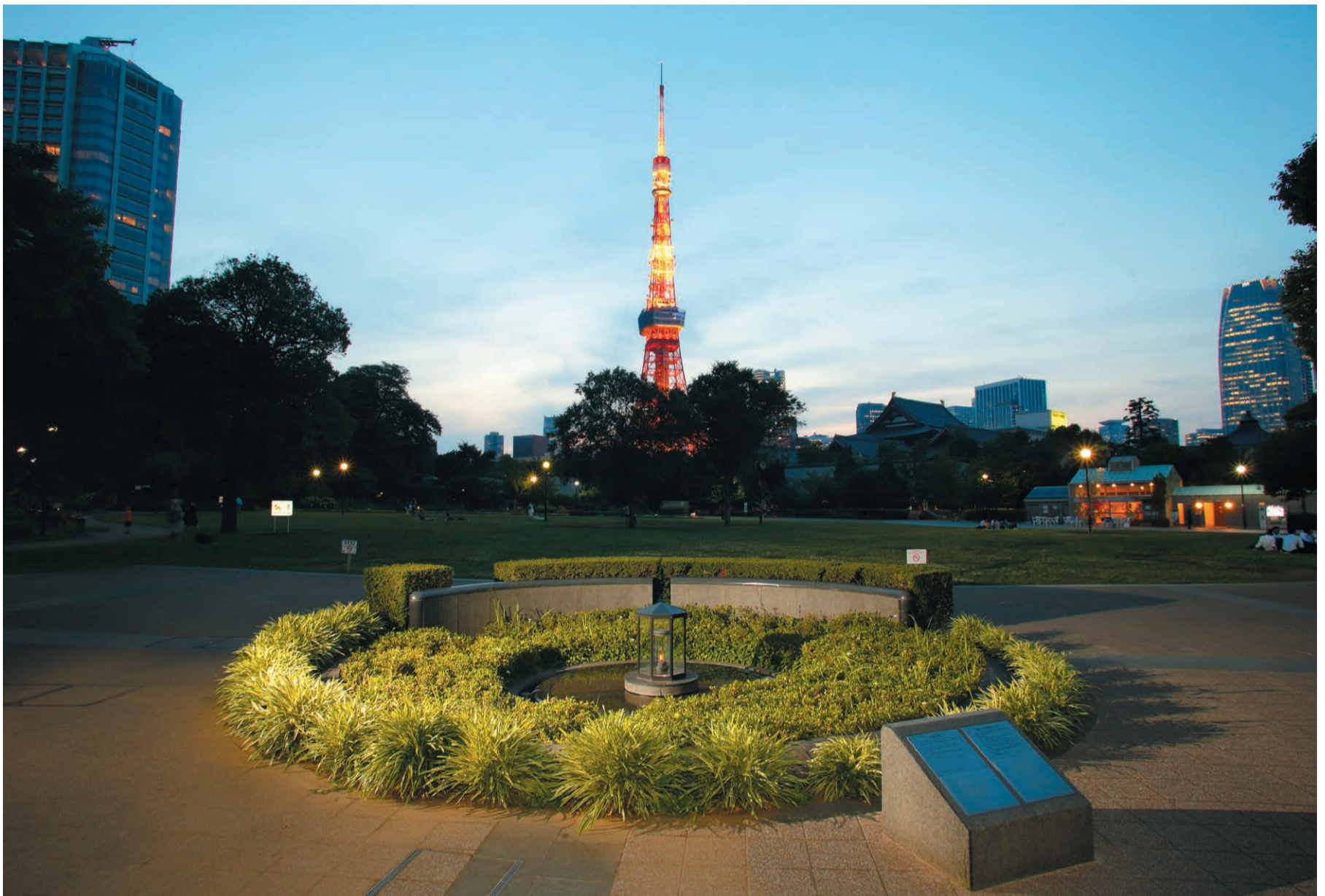
Flame of peace at the municipal Shibakoen, 4-8-4 Shibakoen