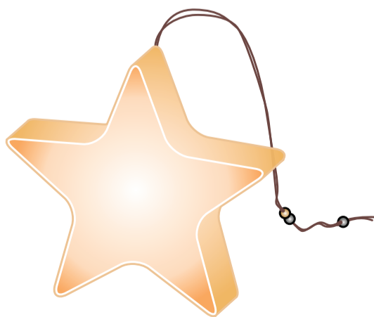
A modern-style chochin lantern in a star shape

With a great variety of features and types of chochin , you may find your favorite one that fits your needs. May chochin sooth you gently and silently, taking you away from the hustle and bustle of the city for a moment.