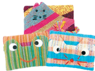
Animal tissue cases

Tour the museums and collect as many stamps as possible for a chance to win prizes.