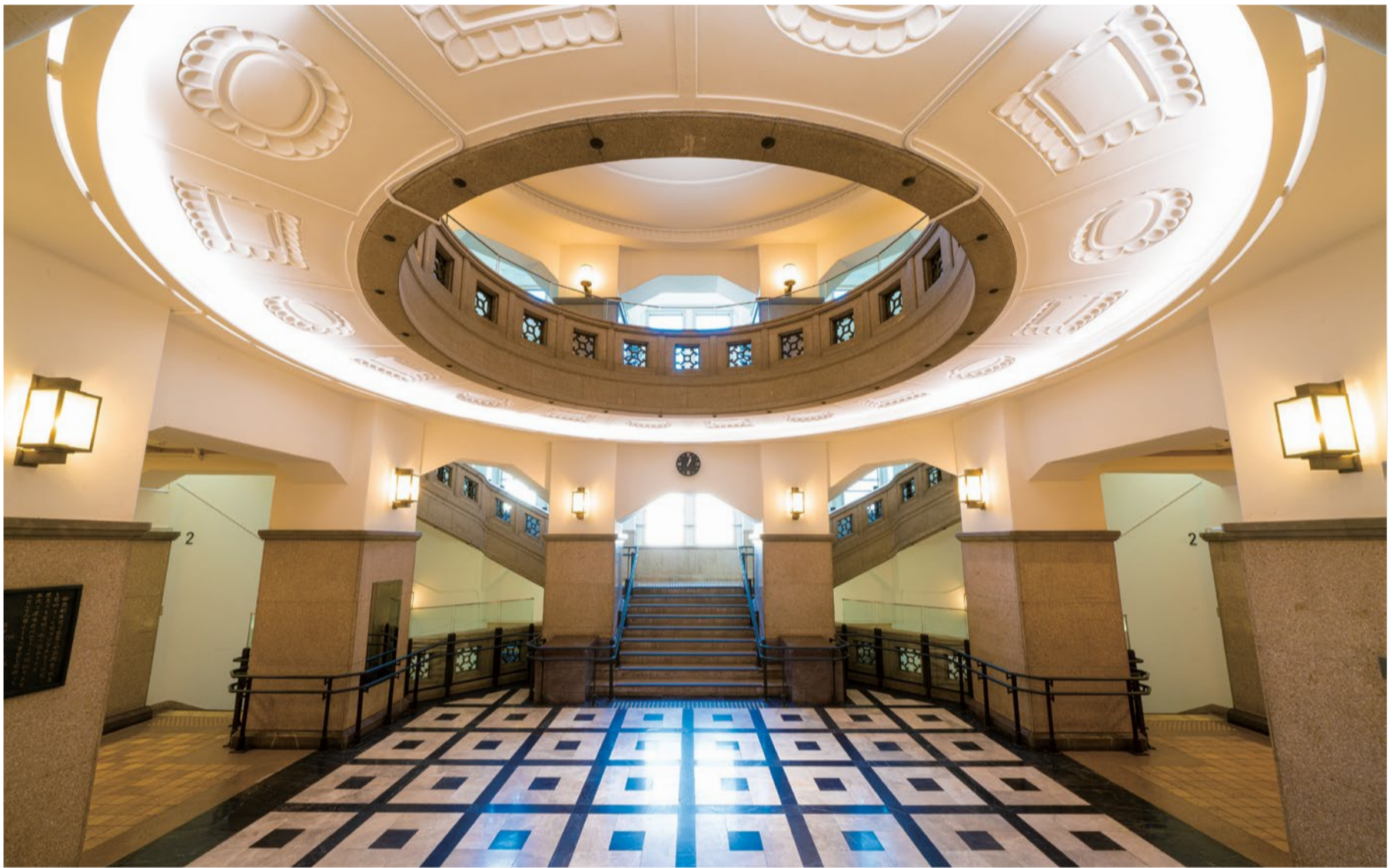
Central hall of Minato City Local History Museum