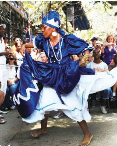
African dancing, a symbol of Cuban culture and its diverse blend of ethnicities and cultures