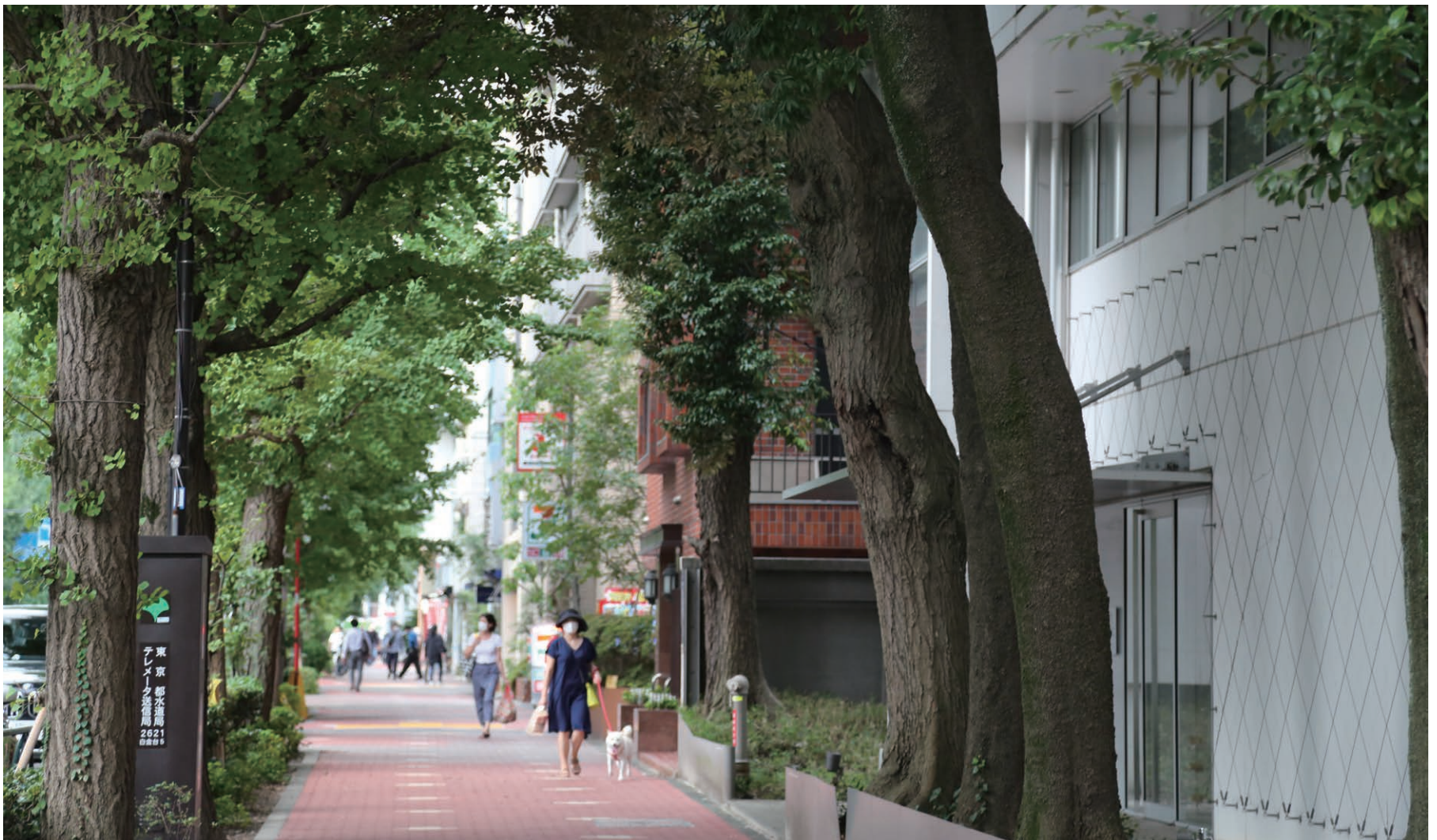
Shirokane Platinum Street