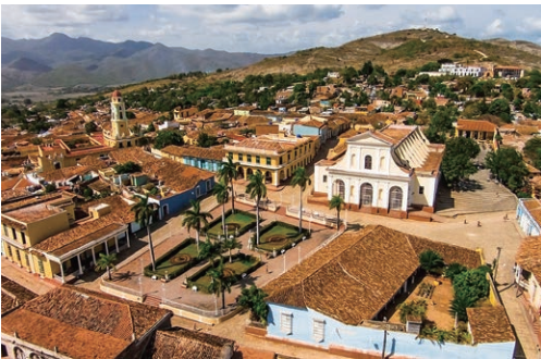
The townscape of Trinidad, listed as a UNESCO World Heritage Site

Visitors are welcome to view photographs showing diverse scenes of Cuba, an island nation in the Caribbean Sea. Date & time: November 10 to 25, 8:30 a.m. to 5:15 p.m., until 7 p.m. on 11 and 18. Place: Minato City Hall 1F Lobby An ikebana display will be held by the Minato City Flower Arrangement and Tea Ceremony Association from noon on November 24 to 5 p.m. on 25. Inquiries: Global Community Planning Subsection, Tel: 03-3578-2046