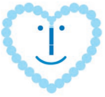
Minato City logo for smoking area

People who live, work, and visit Minato City need to follow the Minato City Smoking Rules. Please follow the smoking rules. We appreciate your cooperation.