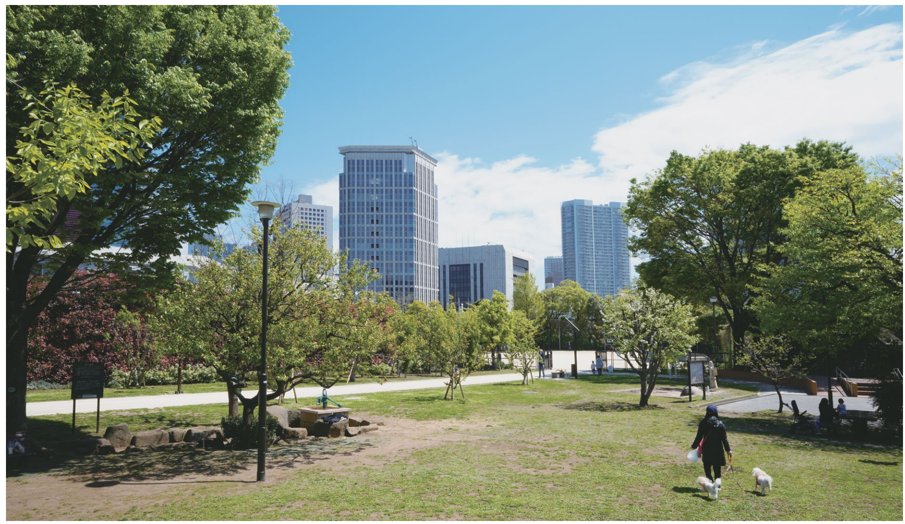
Mitadai Park, 4-17-28 Mita