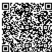
Scan this code and visit the Minato City web regarding the COVID-19 vaccination.

*Saturdays, Sundays and national holidays, 8:30 a.m. to 5:30 p.m.