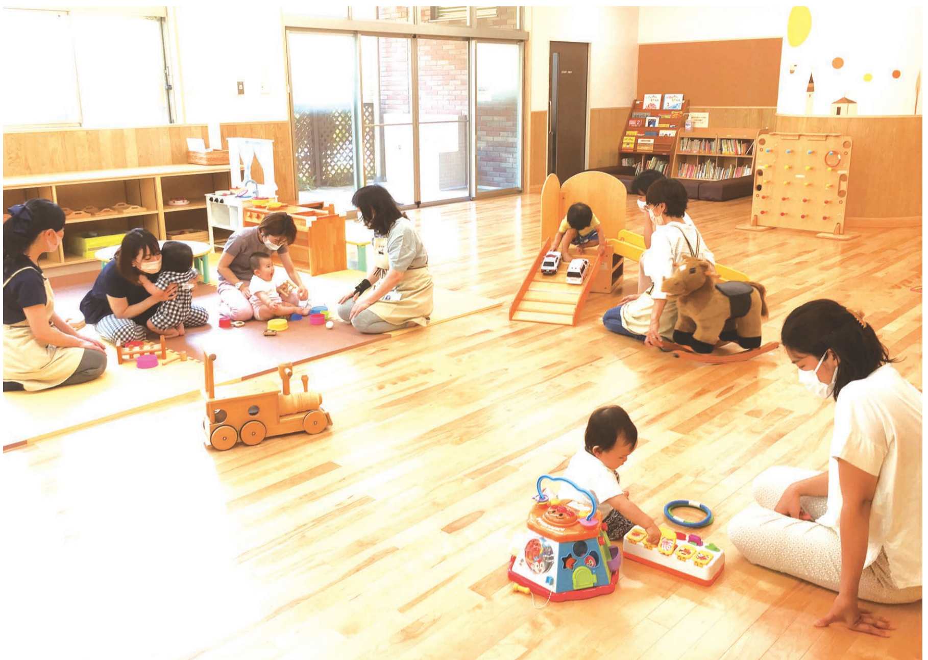
Family Play Room of Children and Families Support Center