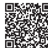
Scan this code and visit the Minato City web regarding the COVID-19 vaccination.

The opening dates of the venues and other latest information is updated daily and available on Minato City's website.