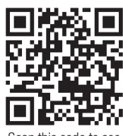
Scan this code to see km Mobility Service website.

Supervising Subsection: Community Transportation Subsection, Tel: 03-3578-2279