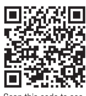
Scan this code to see Fuji-express website.