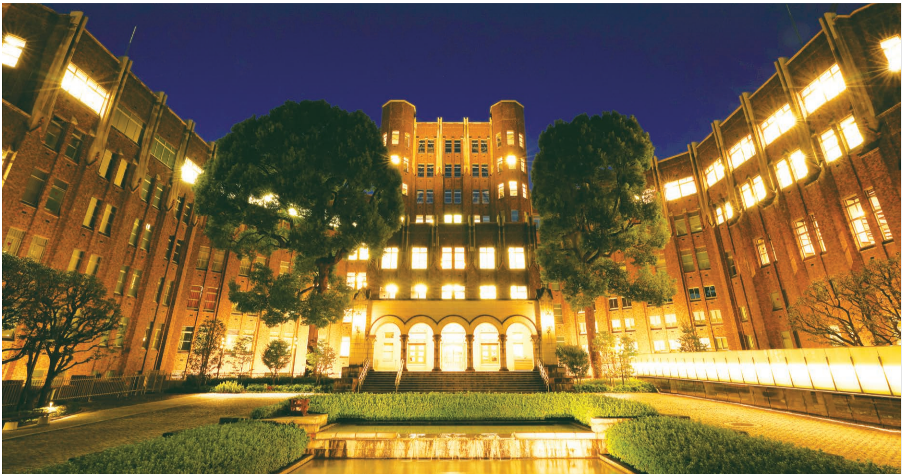
Lights inside the facility were turned on for photography. The actual scene may differ with the above photo. Minato City Local History Museum is open until 8 p.m. on Saturday, close at 5 p.m. on other days. For more information about the operating hours, visit its website.