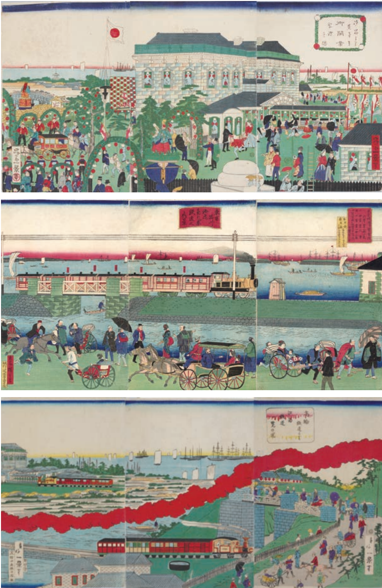
Owned by Minato City Local History Museum