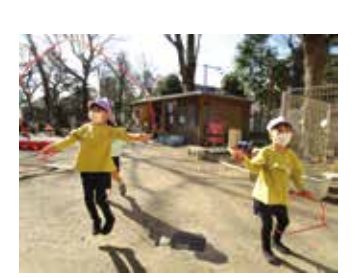
Playing jump rope outdoors