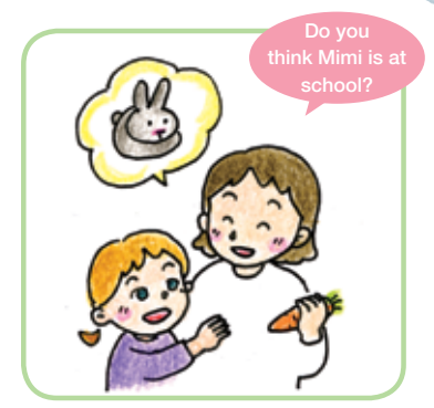
Talk to your child using expressions that may change his/her mood.

After they get home, let your child relax and cuddle. Such bonding time will give your child the strength to go back to school the next day.