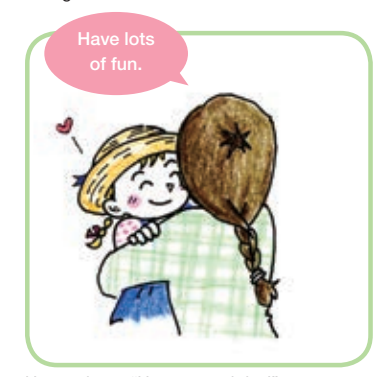
Hug and say, "Have a good day!"