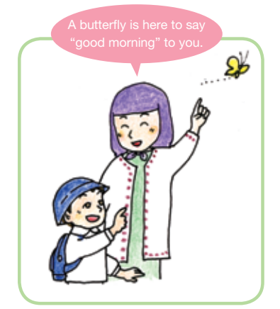
Make the walk to preschool fun, such as by looking at flowers along the way and hunting for insects, etc.